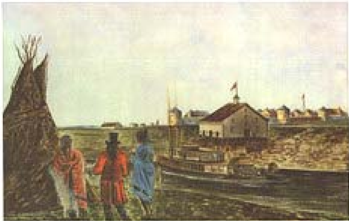
Fort Garry 1875, Frank W. Lynn (University of Manitoba Archives and Special Collections)

In 1869, the Hudson's Bay Company agreed to surrender its monopoly in the North-West, including Upper Fort Garry. In late 1869 and early 1870, the fort was seized by Louis Riel and the Metis during the Red River Resistance. The fort was the site of the meetings of the Legislative Assembly of Assiniboia in 1870. This Assembly led by Louis Riel brought Manitoba into Confederation. Manitoba is the only province in Canada brought